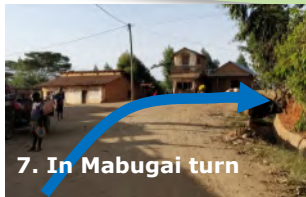
7. In Mabugai turn