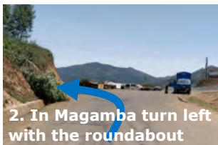
2. In Magamba turn left with the roundabout