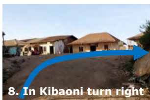
8. In Kibaoni turn right