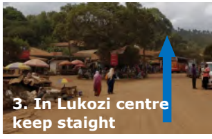
3. In Lukozi centre keep straight