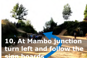
10. At Mambo junction turn left and follow the sign boards