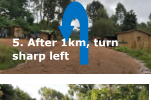
5. After 1km, turn sharp left

15 min—6 KM 20 min—10 KM 1H—30 KM 1.5H—50 KM 1H45—55 KM