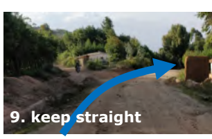
9. keep straight