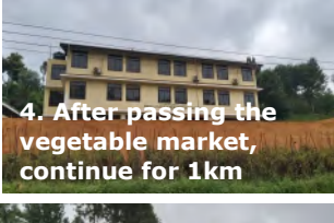
4. After passing the vegetable market, continue for 1km