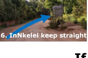
6. In Nkelei keep straight

15 min—6 KM 20 min—10 KM 1H—30 KM 1.5H—50 KM 1H45—55 KM